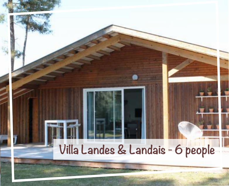
Villa Landes & Landais - 6 people