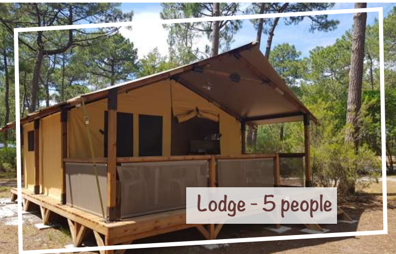
Lodge - 5 people