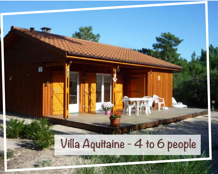
Villa Aquitaine - 4 to 6 people