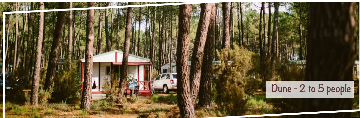
Dune - 2 to 5 people