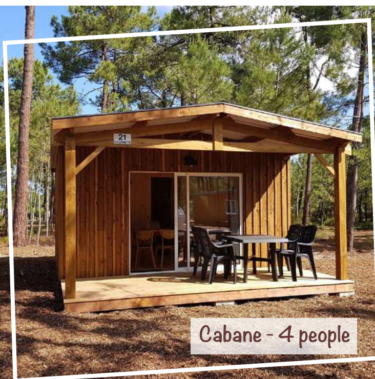
Cabane - 4 people