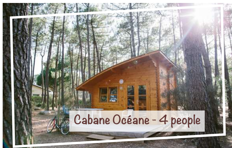
Cabane Océane - 4 people