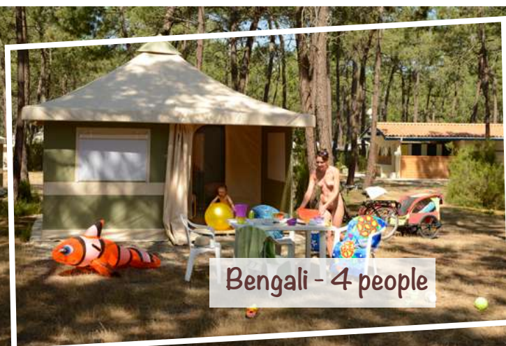
Bengali - 4 people