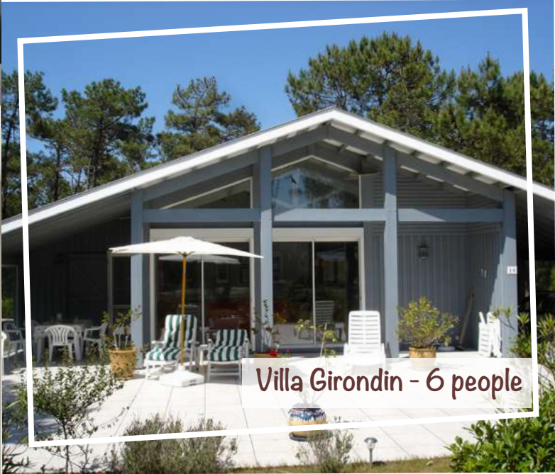
Villa Girondin - 6 people