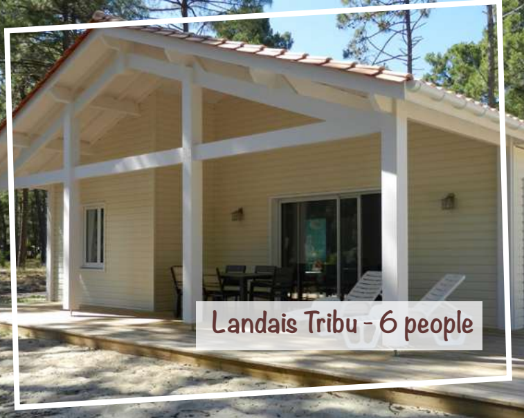
Landais Tribu - 6 people