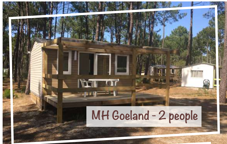
MH Goeland - 2 people